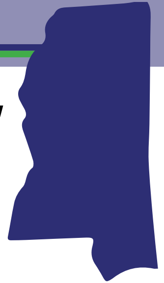
Per Capita Income